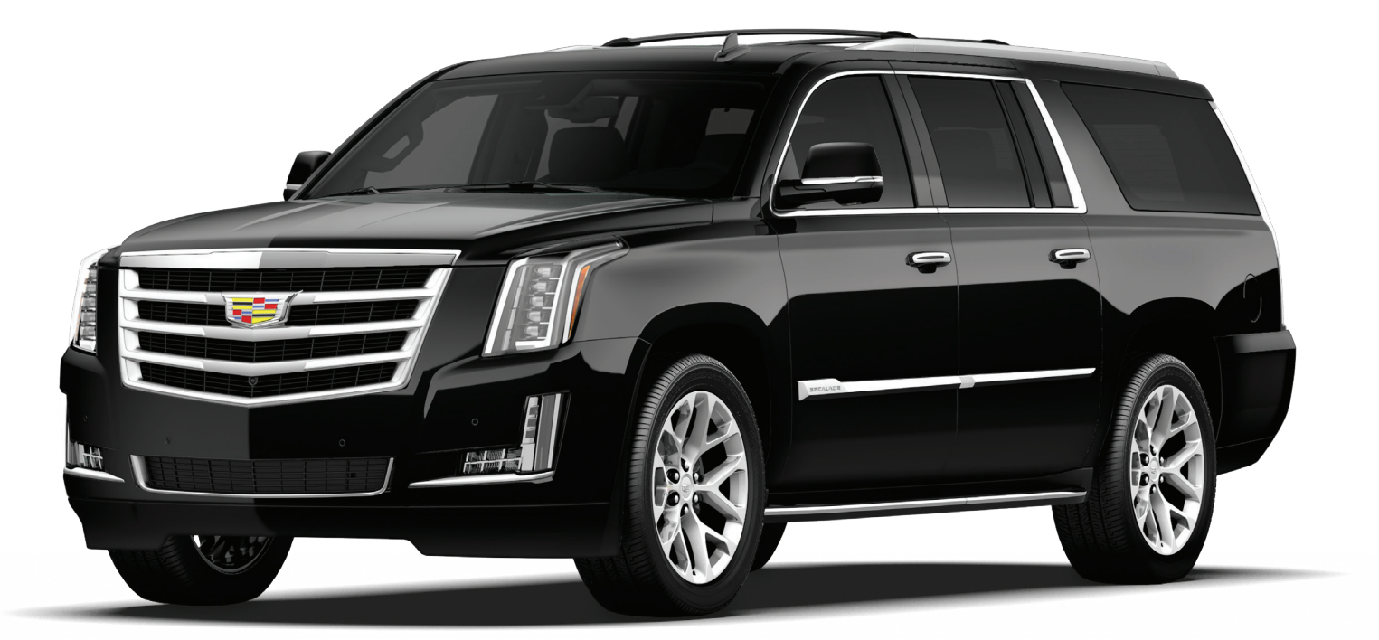
Vehicle shown with 22-Inch Wheels<sup>2</sup> and Roof Rack Cross Rails.

Escalade ESV delivers extended luxury with seating for up to eight adults, 45 cubic feet of interior space! Bose® Centerpoint® Surround Sound System and rearview camera. Cadillac Accessories can be the perfectly tailored complement to the outsized luxury of Escalade ESV.