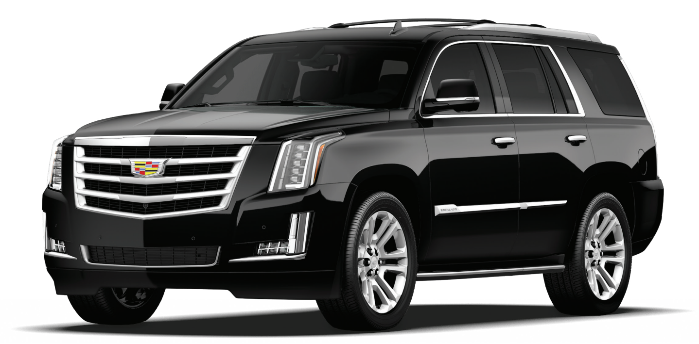
Vehicle shown with 22-Inch Wheels<sup>1</sup> and Roof Rack Cross Rails.

Escalade is the acclaimed luxury SUV with its 6.2L 403-hp V8 engine, rearview camera, heated and cooled front seats, and Tri-Zone Climate Control. The portfolio of Cadillac Accessories offers the perfect finishing statement for Escalade.