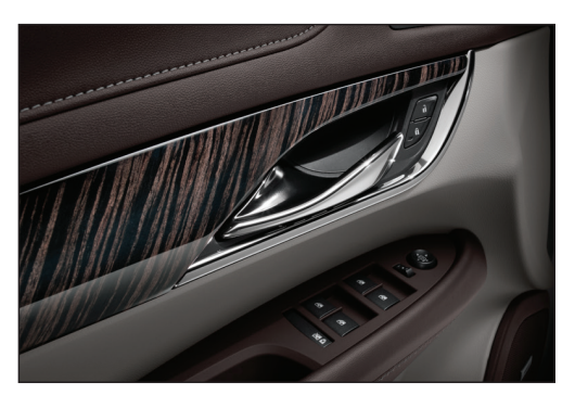
Interior Trim Kit - Black Olive Ash