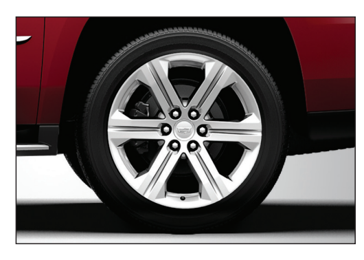
22-Inch Wheel - 6-Split-Spoke Chrome (SEZ)<sup>2</sup>