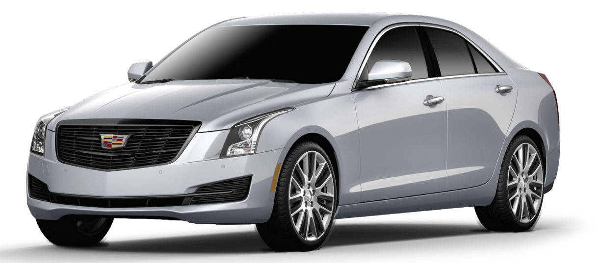
Vehicle shown with 19-Inch Wheels<sup>1</sup> and Black Chrome Grille.

ATS is a world-class Cadillac like no other – a compact sport sedan that is as luxurious as it is technologically advanced. That's exactly what you can expect from the finely crafted collection of Cadillac Accessories available for the ATS Sedan.