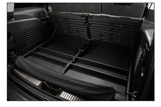
Cargo Partition Package - Black

<sup>1</sup> Cargo and load capacity limited by weight and distribution.