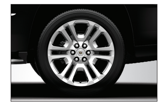
22-Inch Wheel - 6-Split-Spoke Chrome (SEU)

<sup>1</sup> Use only Cadillac-approved wheel and tire combinations. See www.cadillac.com/accessories for important tire and wheel information.