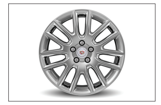
19-Inch Wheels - Front Aluminum, Sterling Silver Premium Painted

<sup>1</sup> Use only Cadillac-approved wheel and tire combinations. See www.cadillac.com/accessories for important tire and wheel information.